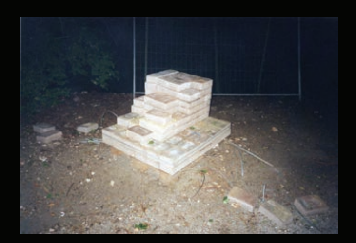
THE "FUNDAMENTAL FOGS"

WE MET THE "FUNDAMENTAL FOGS" DURING A WALK/ I THINK IT IS COOL THAT THEY ARE STILL INTO WHAT THEY DO