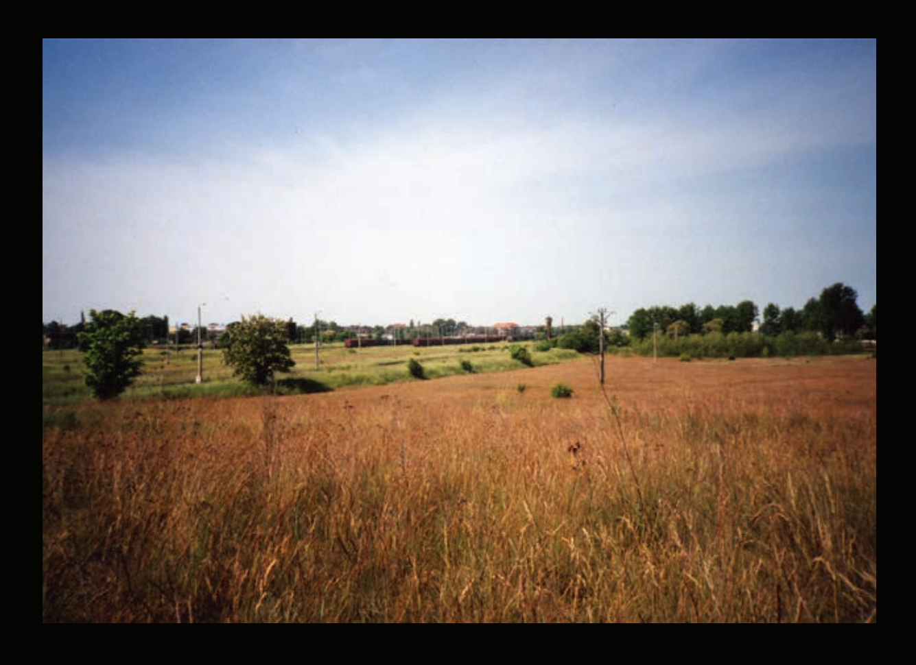
THE VALLEY OF REDUIK (POLISH HOME YARD)

MANY PEOPLE WENT TO SEE THIS PLACE/ IT HAS ABOUT 150 BOXCARS THERE/ THEY COME FROM SERBIA, ITALY OR SWEDEN/ THE HOME YARD HAS UNIQUE WORKERS THAT WILL GIVE YOU A ONE-ON-ONE DEMO.