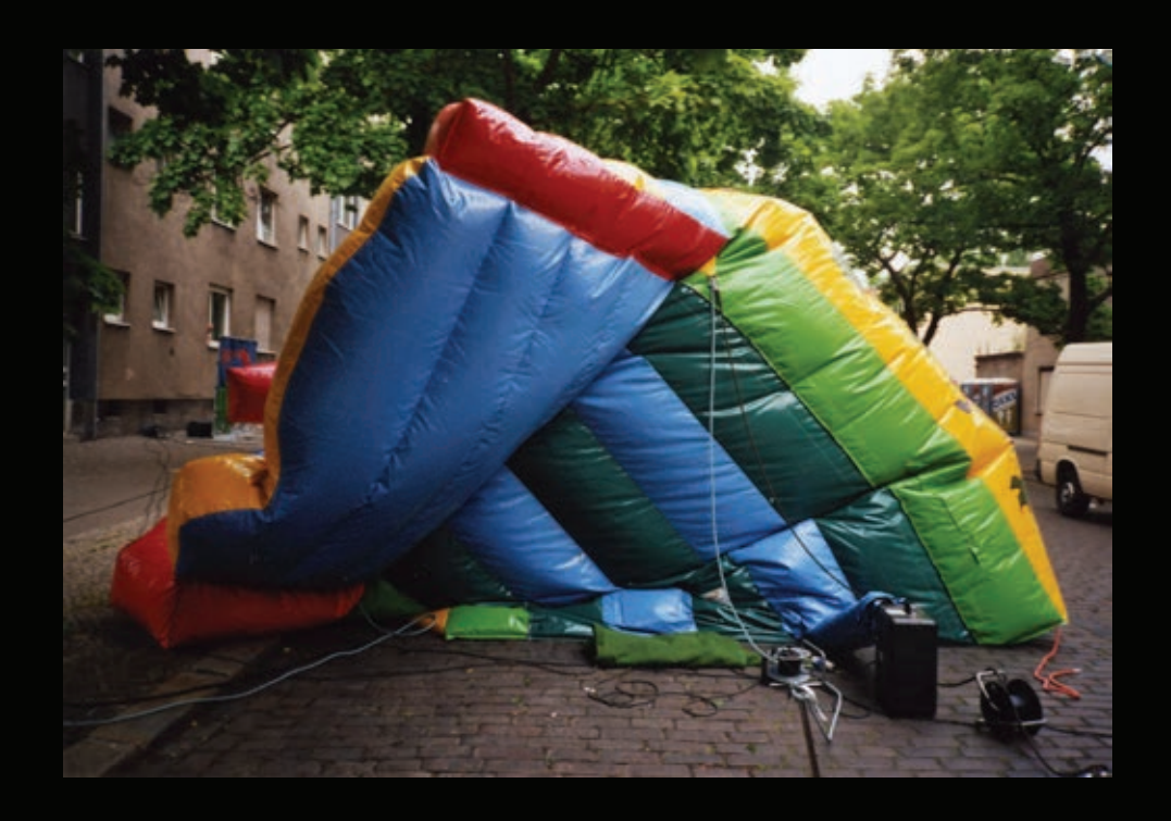
THE "BOUNCY BOUNCE" (BOUNCE CASTLE) THIS IS THE "BOUNCY BOUNCE"