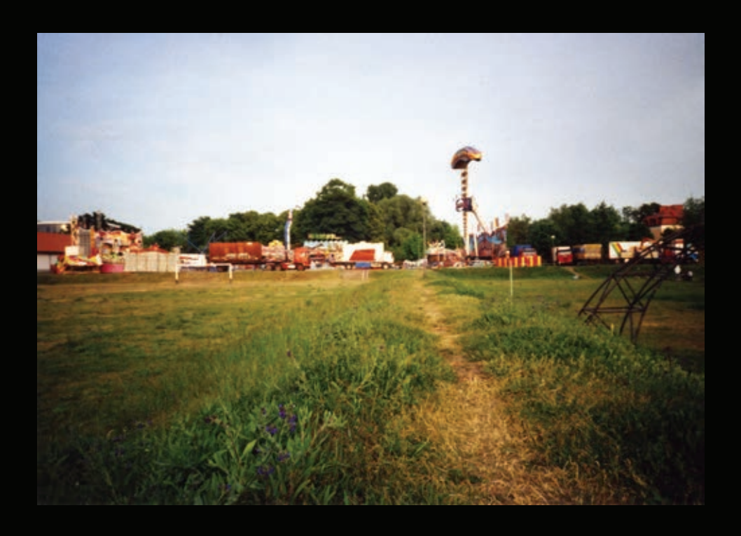
THE FAIR IT WASN'T IN USE ANYMORE WHEN WE CAME.