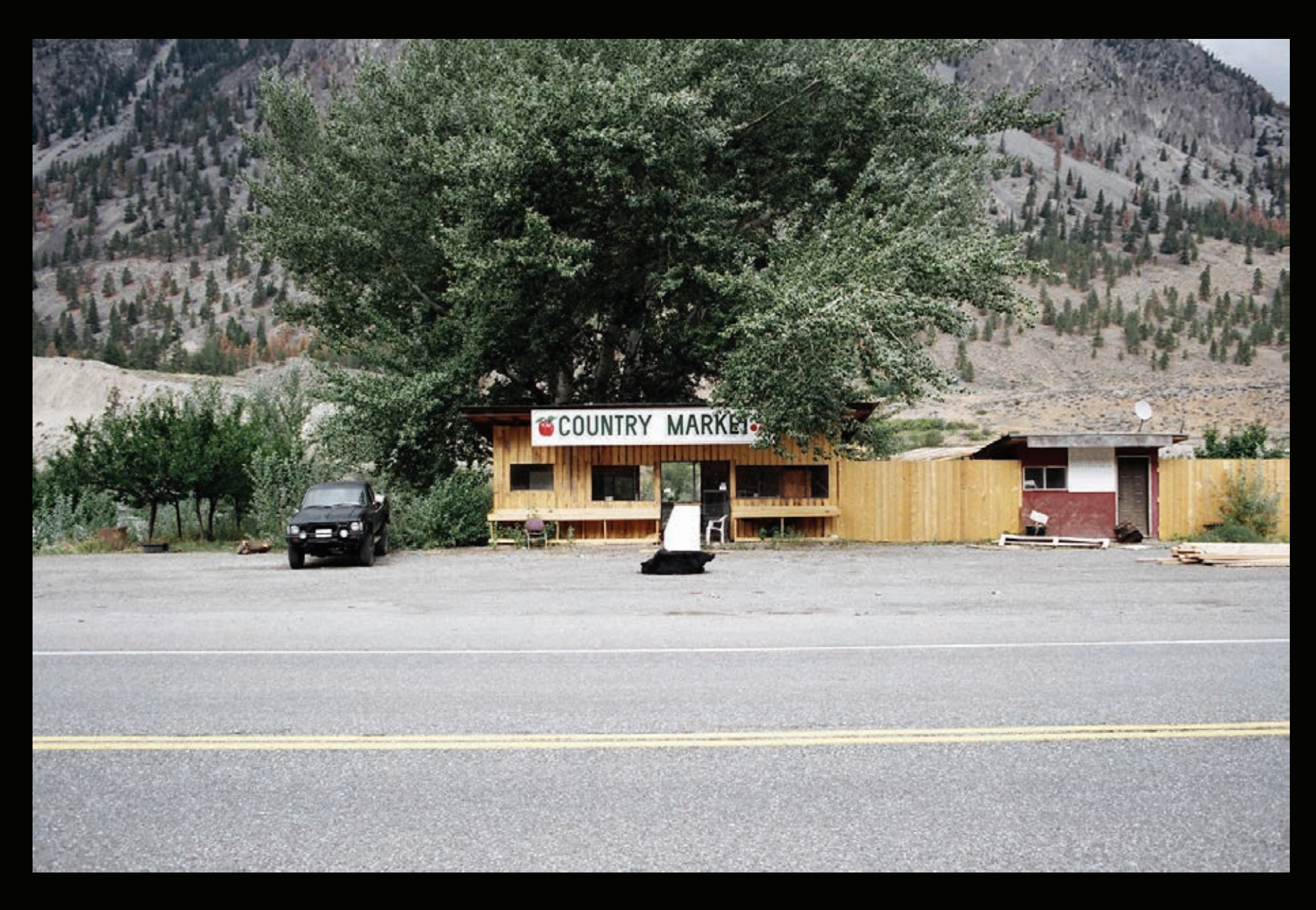
THE DEAD BEAR IN FRONT OF THE ABANDONED MARKET